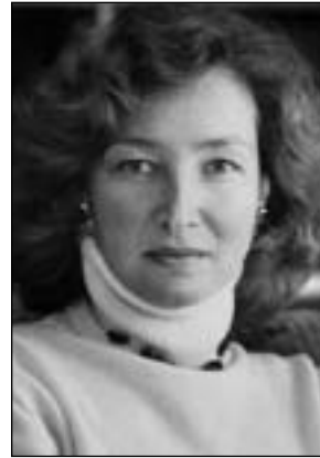
Hon. Rosalie Abella