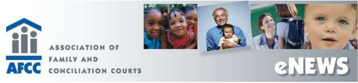
July 2021 VOL. 16 No. 7