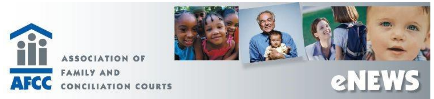
July 2019 VOL. 14 No. 7