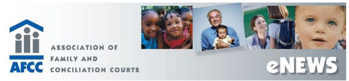
VOL. 14 NO. 4 APRIL 2019