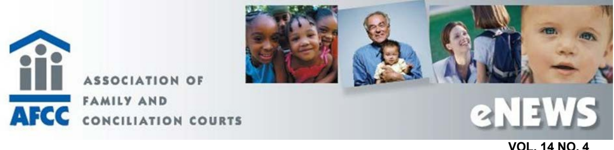
OL. 14 NO. 4/ APRIL 2019