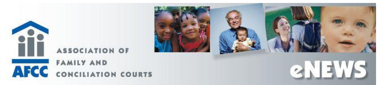
VOL. 12 NO. 4 APRIL 2017