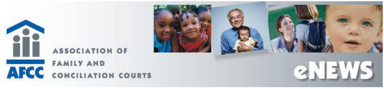
VOL. 12 NO. APRIL 2017