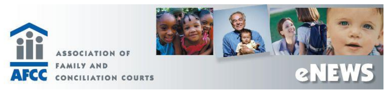
VOL. 12 NO. 4 APRIL 2017