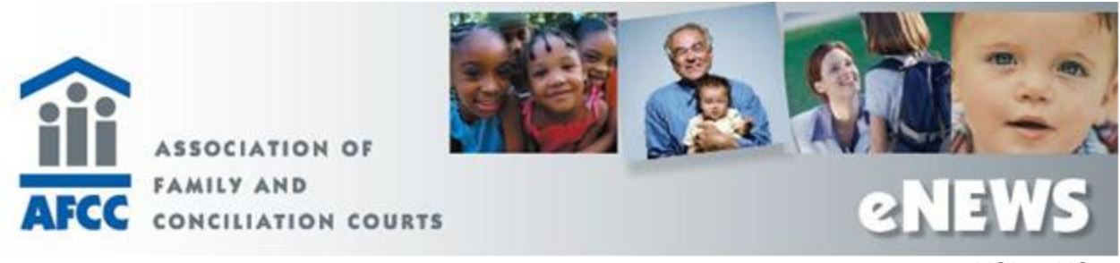
VOL. 8 NO. 4 APRIL 2013