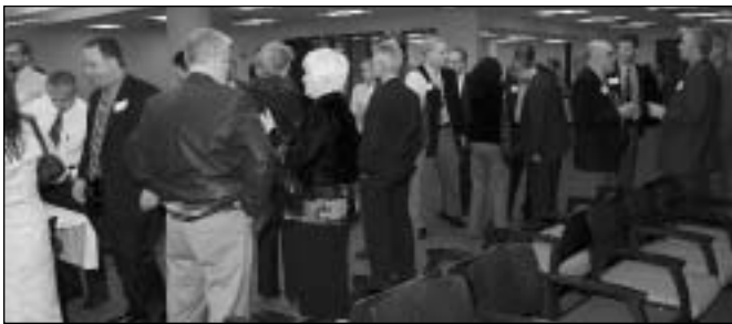
AFCC hosts a networking opportunity in Tampa, Florida.