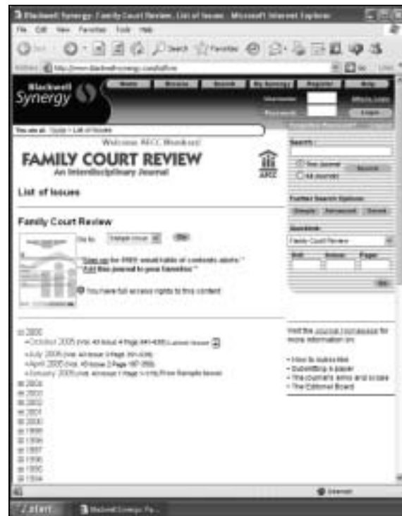
Family Court Review Online

Logging onto Family Court Review (FCR) online just got better! Members can now register for free "Table of Contents" email alerts. When registered, the alerts are sent to your email address. The alerts will notify members when FCR is posted online and topics that are included in the issue.