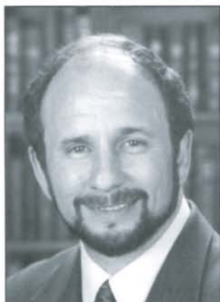
Hon. Paul Wellstone

Hon. Paul Wellstone went from teaching political science at Carlton College in Northfield, MN, to the floor of the United States Senate after becoming the only challenger to unseat an incumbent in the 1990 Senate elections. Well known for his grassroots organization and for his progressive policies, Senator Wellstone helped lead the fight to ensure that parents could take time from work to care for sick children and aging parents. He also introduced legislation to provide $65 million to support supervised visitation programs. Senator Wellstone is an outspoken advocate of the Violence Against Women Act and is supporting legislation to enable public school personnel to work with children who witness domestic violence.